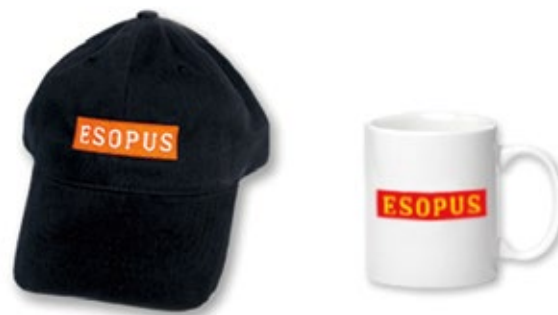
Esopus Baseball Cap. 100% cotton unstructured brushed twill cap with adjustable strap (black with orange "ESOPUS" logo).