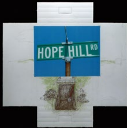
Robert Gober, Hope Hill Road , 2012. Signed-and-numbered 5-color lithograph printed with light-fast, color-sensitive inks on acid-free paper, mounted to archival board, 20.125" x 20.25" (flat). Edition of 25.