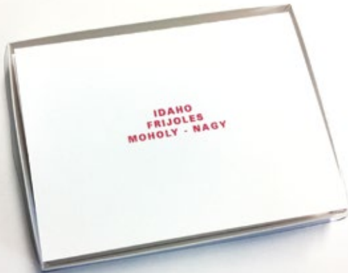
Kay Rosen, Ho, Ho, Ho , 1995/2011. Boxed set of five archival digital prints on 100% cotton rag greeting cards, each signed and numbered by the artist. Dimensions: 6.25" x 4.5". Edition of 25 sets.