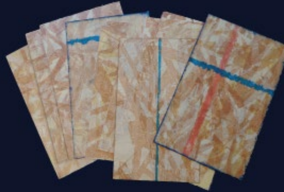
Bryan Nash Gill, Outtakes , 2012. 15 unique woodcut prints on Rieves BFK paper, each signed and numbered by the artist. Sizes range from 6.25" x 9.5" to 7" x 11". Edition of 15.