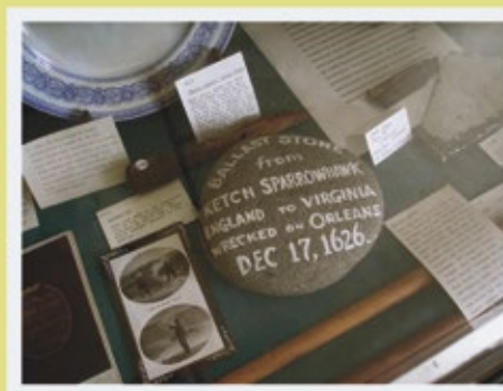
Matthew Benedict, Ballast Stone , 2013. Archival inkjet print on fine art uncoated paper. Signed and numbered by the artist. Dimensions: 17.25" x 23" [sheet size: 20.25" x 26"]. Edition of 20.