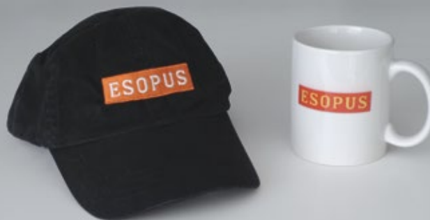
Esopus Baseball Cap. 100% cotton unstructured brushed twill cap with adjustable strap (black with orange "ESOPUS" logo).