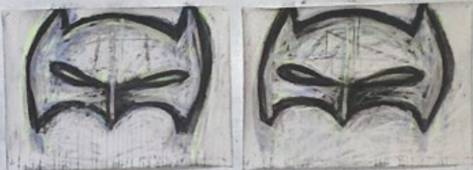
Joyce Pensato, Batman 3 [left], Batman 4 [right], 2013. Charcoal and pastel on paper, each signed, titled, and dated in pencil verso. Dimensions: 17" x 23". Two unique drawings.