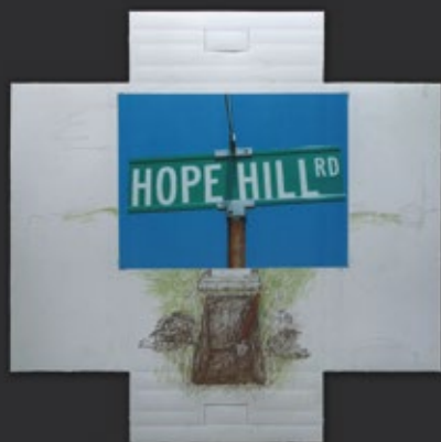
Robert Gober, Hope Hill Road , 2012. Signed-and-numbered 5-color lithograph printed with light-fast, color-sensitive inks on acid-free paper, mounted to archival board. Dimensions: 20.125" x 20.25". Edition of 25.