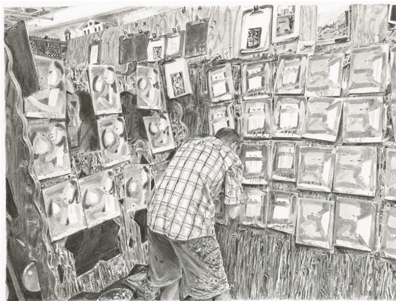
Steve Keene works on paintings for Esopus Premium subscribers in 2017, from Tod Lippy: Esopus Drawings (©2018 Tod Lippy)

Edition of 1500; $50 or free with a Premium subscription to Esopus