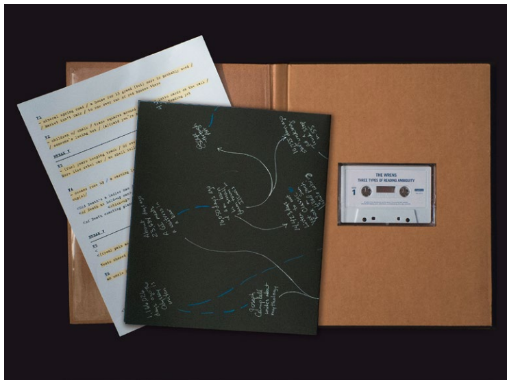
ABOVE: Three Types of Reading Ambiguity , with Campbell's artwork and Bissell's song lyrics