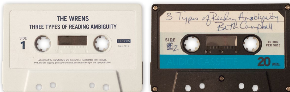
ABOVE: Both sides of custom-designed audio cassette from Three Types of Reading Ambiguity

Edition includes brand-new track from The Wrens and an artwork by Campbell