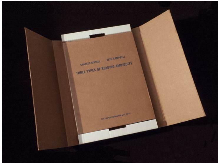
ABOVE: Three Types of Reading Ambiguity in its packaging