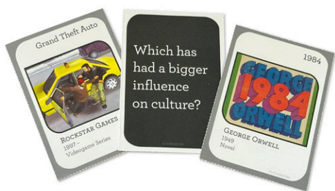
Game cards from Metagame: Culture Edition, which were included in Esopus 17 (2011) as removable inserts.