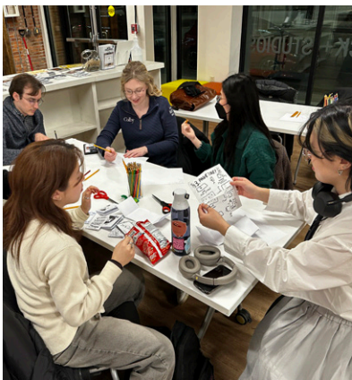
Participants at the first Magazine-Making Workshop on Tuesday, February 13.

Tuesday, February 13, 5:30-7:30 p.m., March 14, 5:30-7:30 p.m., April 6, 2-4 p.m., Thursday, May 9, 5-7 p.m. at Greene Block + Studios, 18 Main Street, Waterville