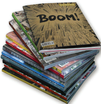
Esopus issues 1-11