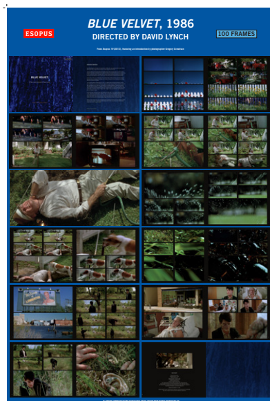
"100 Frames" poster for the film Blue Velvet

Free and open to all, but ticket reservation is encouraged. Frame by Frame is a collaborative program of the Colby College Museum of Art and the Maine Film Center. Film screenings are paired with speakers or programs that connect what we see on the big screen to what happens in the museum.