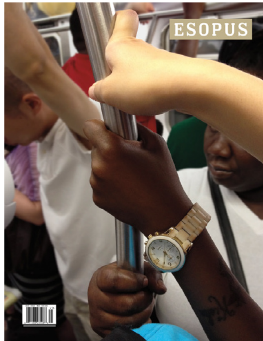
Cover of Esopus 24