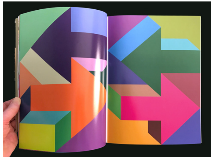
Spread from Tony Tasset's artist's project Me and My Arrow , containing 16 removable inserts