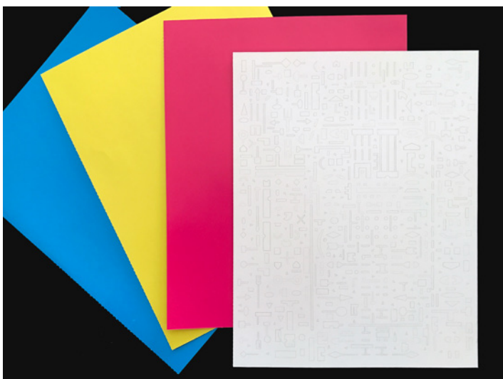
The components of Marco Maggi's artist's project, Drawing Set , which offers readers the opportunity to create their own artworks from a sheet of more than 500 die-cut adhesive forms created by Maggi; resulting artworks will be exhibited at the New York Public Library in the fall of 2017