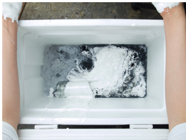
One side of Hayden Dunham's edition for Premium subscribers

Artist Hayden Dunham has created a limited-edition artwork to be included with Premium subscribers' copies of Esopus 24 . The insert, Untitled 2017 , a 8.25" x 11" double-sided photograph printed with archival UV inks, is related to Dunham's project for the issue, and is available only to current Esopus Premium subscribers.