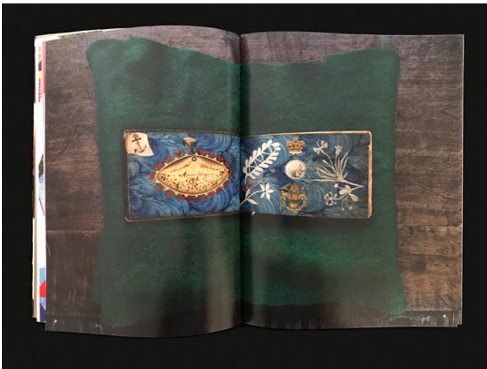
Spread from "Public Access," featuring a friendship album from the early 19th century from the Pforzheimer Collection of the New York Public Library