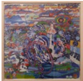
Ati Maier See It Loud , 2005 Limited-edition offset print 16 x 16 inches Edition 19/25