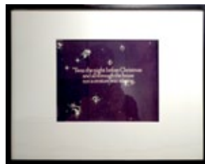
Richard Misrach Untitled Color photograph 9 ½ by 7 ½ inches Artist's proof