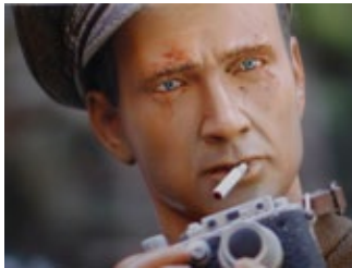
Mark Hogancamp Untitled , 2009 Digital C-print on archival paper 26 by 17 ½ inches