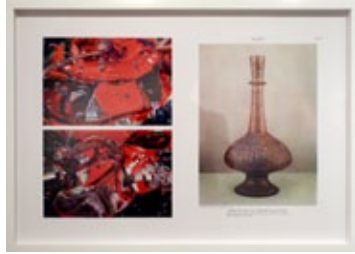
Jeff Gibson Untitled , 2009 Archival inkjet print 24 \frac{3}{4} x 17 \frac{3}{4} inches Edition 4/5