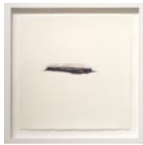
Chris Doyle Untitled House , 2002 Watercolor 9 x 9 inches