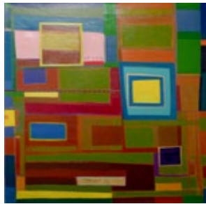
Juri Morioka Our Own Language , 2010 Acrylic and 23.5k gold on canvas 24 x 24 inches