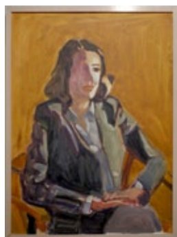
Michael Iskowitz Hillary , 2009 Oil on canvas 19 x 25 inches