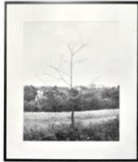
Mary Ellen Carroll A Tree Leafless (for Paul Celan) , 1997 24 by 20 inches Silver gelatin print Edition 2/3