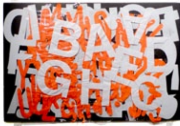
Alex Masket Untitled (Plastic Layers) , 2008 Adhesive stickers on posterboard 30 by 20 inches