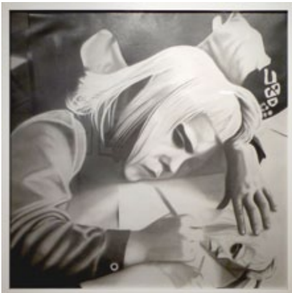
James Pyman Zero to One , 2003 Drawing 47 x 47 inches