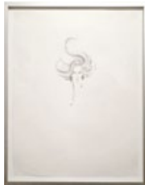
Gareth Jones The Ellnet Lady , 2001 Pencil on paper 10 x 13.5 inches